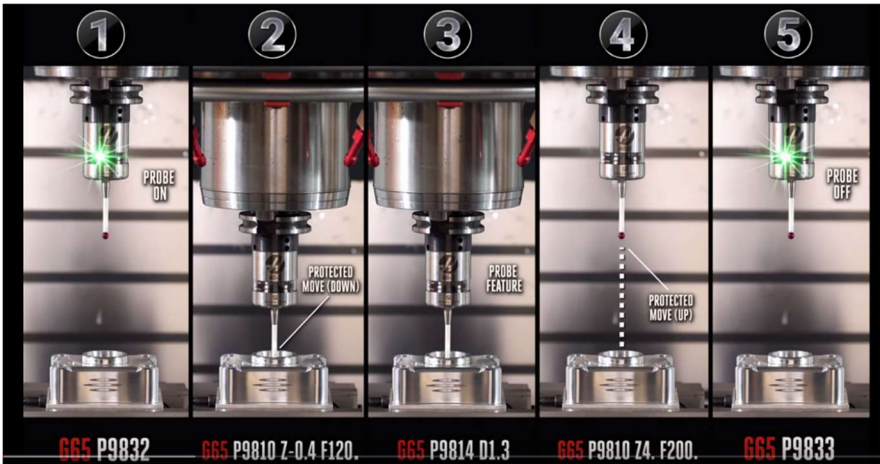
In-Process Part Measurement; Probing in 5 Simple Steps – Haas Automation Tip of the Day

https://www.youtube.com/watch?v=fFZi6rWlcuU&t=200s